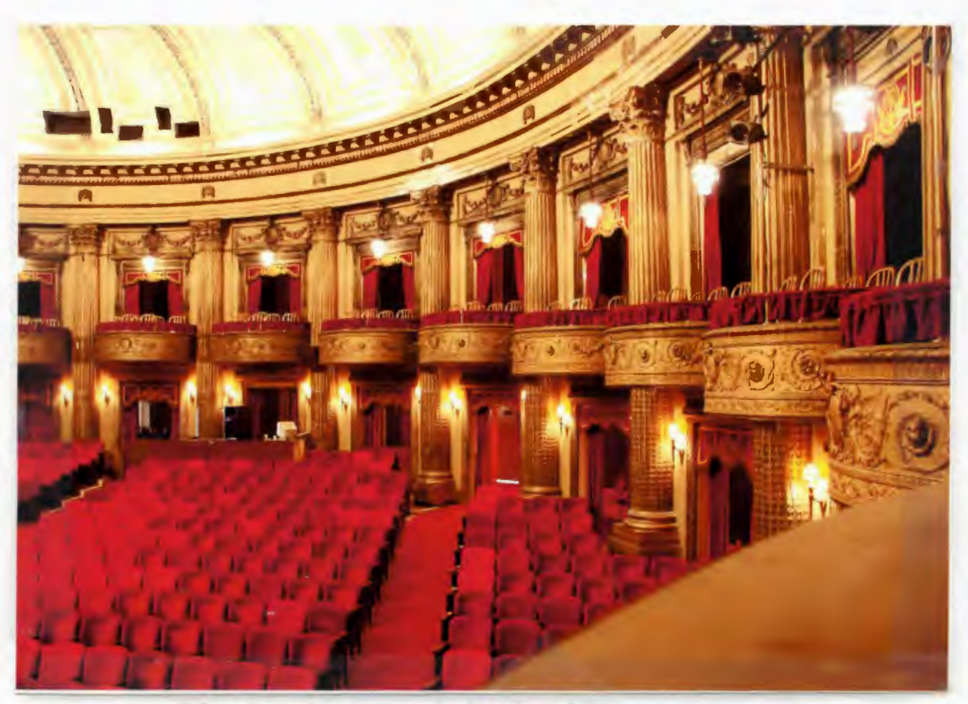
Other than the seating, the interior of the Al. Ringling Theatre remains virtuously unchanged from its palatial décor of 1915.