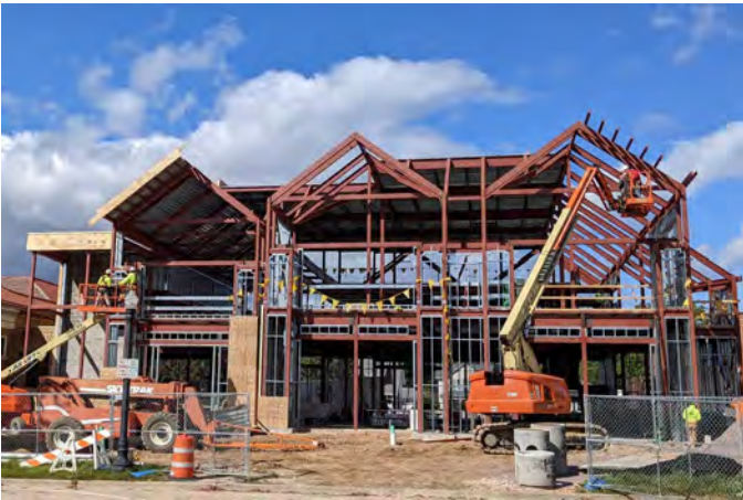
Full view of the structure of the library addition as of late September

The addition is still on track to be enclosed by this winter and to be moved into by May of 2023, and every day the progress is visible. The walls are being framed and insulation is being added. Most of the building has roofing and walkable floors at this point. The new water main and sewer line are going to be installed soon. Keep an eye on our Facebook page for live video updates most weeks!