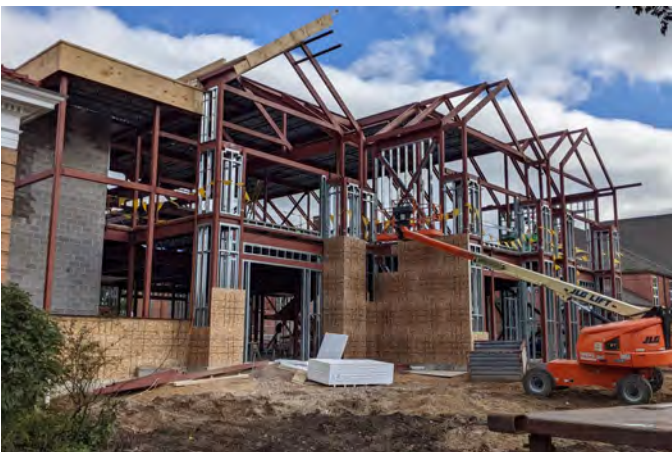
Walls are going up and insulation is being added