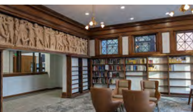
Persche Reading Room, with frieze

D. Sorg Memorial Historic Reading Room and the Ronald Persche Memorial Historic Reading Room on the south side of the building. These spaces have