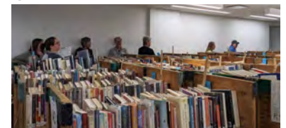
Volunteers starting to move the nonfiction collection

Many hands make light work! Over the course of just a few days, teams of volunteers helped move the adult collections out of storage and into their new homes. Everyone worked so efficiently that the job was completed early!