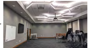
Auditorium, with stacked chairs

The Auditorium, near the Main Service Desk, will be able to be used for larger programs and events. Our inaugural