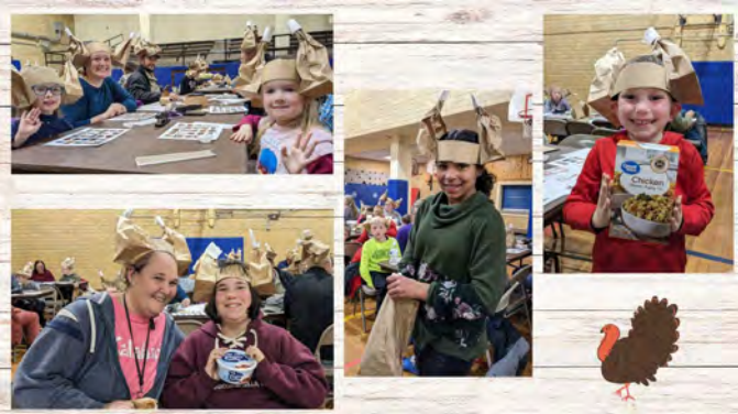
Happy Turkey BINGO participants!

Our Annual Turkey BINGO program was a hit! At this all-ages event, people started out by making their turkey hat that they can wear during the program. Next came the BINGO! Winners received different food prizes that are often used to make a seasonal feast, with a turkey and ham as the two grand prizes. Thanks to everyone for coming out to Turkey BINGO; you make this one of our biggest programs every year!