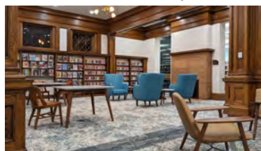
Sorg Reading Room, with fireplace

this level. Through the end of the year, study rooms will be first come first serve, but look for a comprehensive room reservation policy and system in January.