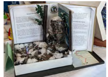
Winter on Balanced Rock