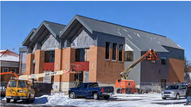
Working on the siding