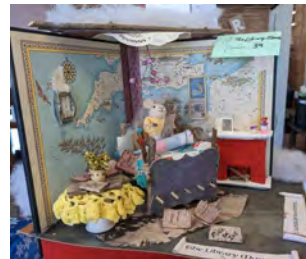
The Library Mouse

During the month of January, the library held a winter-themed diorama contest open to all ages. There were lots of amazing entries into the contest, and library patrons spent the first two weeks of February voting on the winners. The results are in, and the winners are: