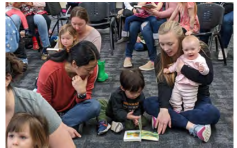
Children and their caregivers practice reading together

Storytots, in room 12/14 of the Baraboo Civic Center, will continue every Wednesday at 10 AM through March 29.