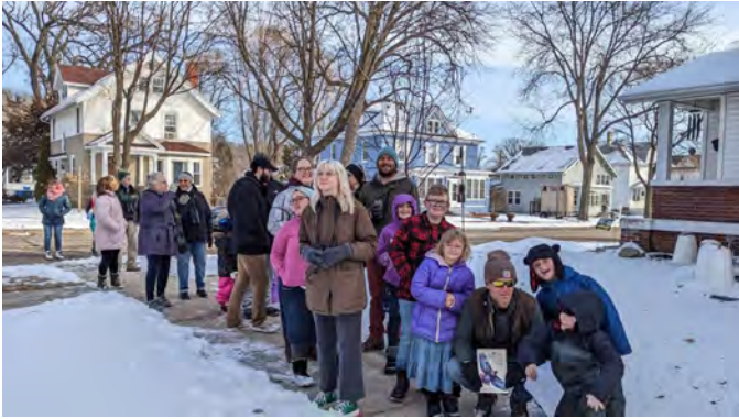
The group stopped to take a picture!

On a chilly, sunny Saturday in February, the library led an all-ages group of birding enthusiasts in a walk around the neighborhood to participate in the Great Backyard Bird Count. This citizen science project has been going on for 25 years and helps researchers understand global bird populations, so they can better conserve and protect birds.