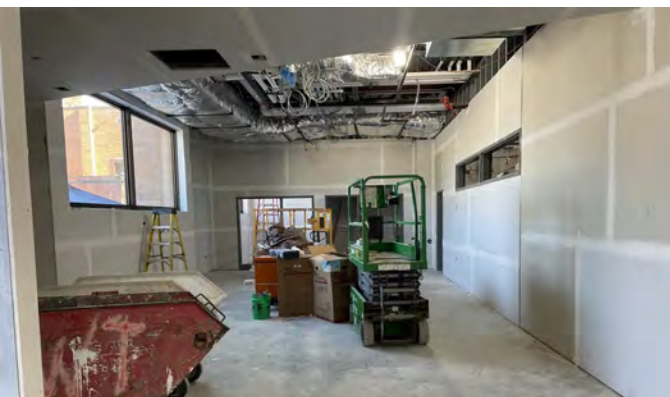
The future Teen Room