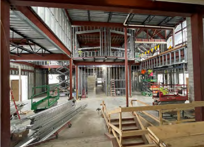
View of the future site of the Circulation Desk (ground floor) and Program Room (directly above the Circulation Desk on the second level).

The library addition continues to proceed on schedule. At this point in the construction, the exterior of the building is staying generally the same, and the bulk of the work is being done in the interior of the addition, including installing insulation, dry wall, plumbing, and HVAC.