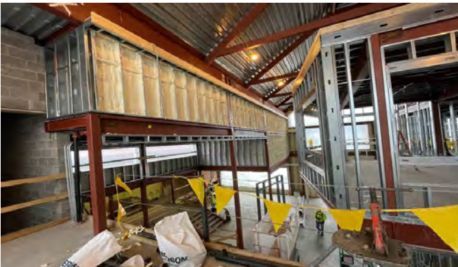
View from the second level overlooking the lobby.