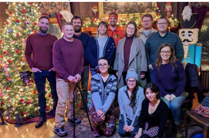
Group photo at the mansion