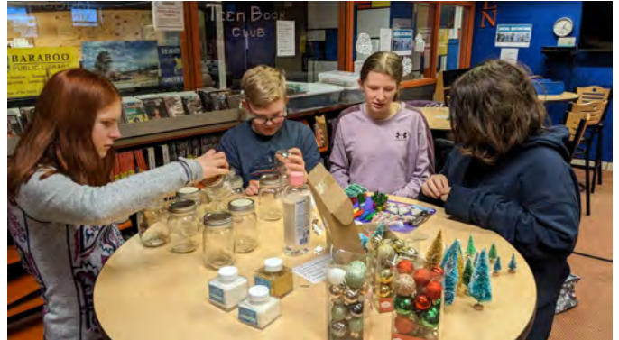
Making festive winter snow globes

Every Tuesday at 4 PM, the library hosts Teen Tuesday, for teens in grades 6-12. In December, the teens had the opportunity to play a family friendly game of JackBox, they made paper snowflakes and snow globes, and they got cozy with coloring and hot chocolate. Teen Tuesdays will continue every Tuesday in January from 4-5 PM.