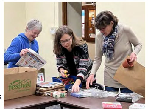
Selecting supplies for crafting

The Baraboo Buds Garden Club is open to anyone who likes gardening in the Baraboo area. In December, the club met to do a craft project with terra cotta pots, decorating them with mod podge and holiday napkins. Participants took home a little houseplant to transplant into their new pot, too. January’s meeting will be a discussion about garden planning. Baraboo Buds meets monthly on the second Tuesday of the month at 6:30 PM in Room 12/14 of the Baraboo Civic Center.