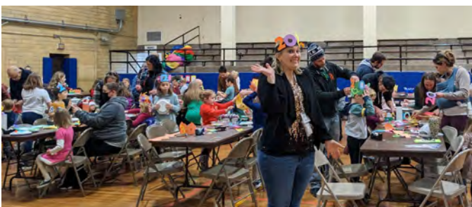
Craft activities included making paper 2023 crowns.