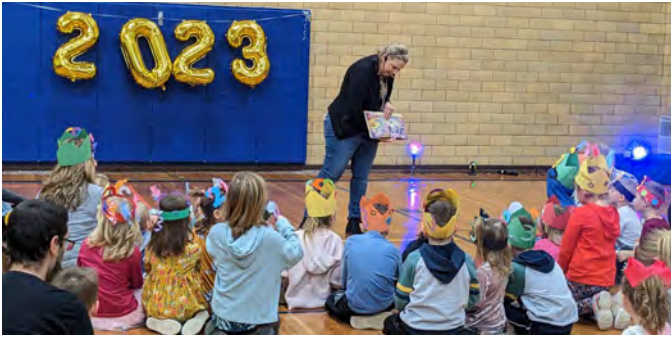
Storytime at Noon Year's Eve

The library held its 9th annual Countdown to Noon Year's Eve on December 31. This event, aimed at children 11 and younger, gives kids a chance to experience the excitement of a party and countdown to celebrate the new year. Children at this year's event enjoyed New Year's Eve craft projects, a storytime about beginnings and endings, bubbles, and playing with parachutes. Thanks to the Baraboo Civic Center for hosting this fun event!