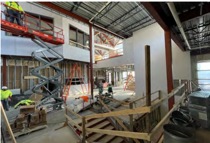
View from the staircase connecting the old library building and the new addition, looking at the future Main Service Desk and program room above.