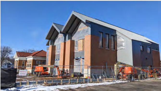
View of the outside of the addition

The library addition continues to proceed on schedule. On the outside, siding is being added, as well as some windows. Inside, the construction workers are currently working to install drywall and lights, and finishing stairs. The photos of the interior below were graciously provided by Tim Stieve.