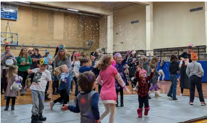
The children enjoyed playing with bubbles!

The library held its 9th annual Countdown to Noon Year's Eve on December 31. This event, aimed at children 11 and younger, gives kids a chance to experience the excitement of a party and countdown to celebrate the new year. Children at this year's event enjoyed New Year's Eve craft projects, a storytime about beginnings and endings, bubbles, and playing with parachutes. Thanks to the Baraboo Civic Center for hosting this fun event!