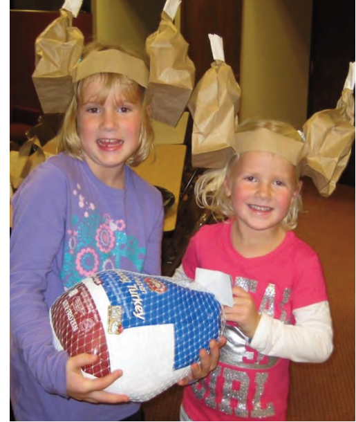
Sporting their stylish drumstick hats, the big winners of Turkey Bingo show off their prize.

We have significantly expanded our patrons’ range of resources by pioneering a cooperative partnership with the UW–Baraboo/Sauk County Library. We now offer Wisconsin’s first library card that gives patrons borrowing privileges at both Baraboo’s public and academic libraries.