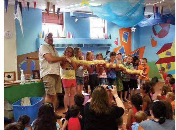
Dig Into Reading was the theme for the summer reading program. Among the highlights was a visit by a live boa constrictor and other creatures of the rainforest with Nature's Niche.