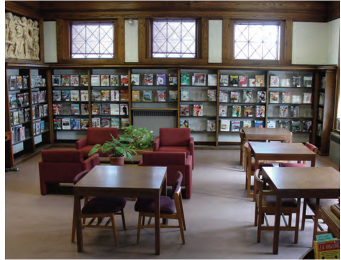
We spruced up the Adult Department reading room with new display boxes for the magazines and newspapers. The library subscribes to 200 different titles!

Our historic building is aging. Some repairs have been made and others postponed. Continued maintenance is a challenge to our operations budget, underscoring the need for building renovation and expansion.