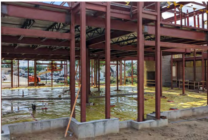
Preparing the ground for the concrete slab