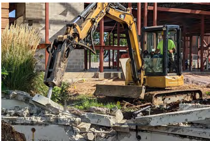
Demolition of the old bench