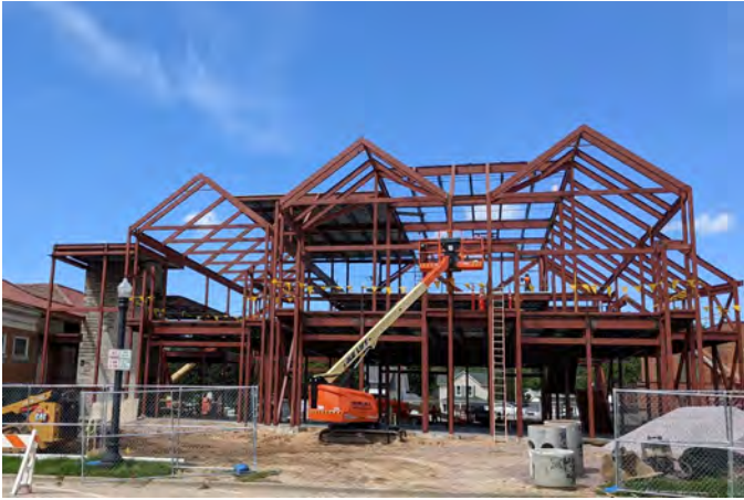
Full view of the structure of the library addition

Construction of the new library addition is progressing on track! The structure has taken shape, there is a walkable floor for the second level, and parts of the roof are going up. Additionally, the concrete slab was installed and the bench to the west of the existing library building has been demolished.