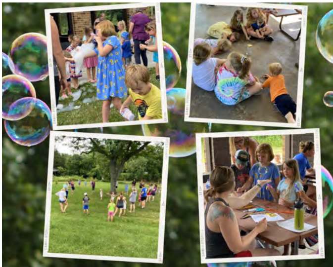
Fun with bubbles at Eco Explorers!

On Wednesday mornings, the library had Stories in the Park, which brought together children and their caregivers, encouraging bonding through early literacy experiences. Each week featured a few early literacy tips, songs, stories, and rhymes, as well as movement activities and outdoor activities that correspond to areas of child development. Stories in the Park is for children from birth to age 5 and their families.