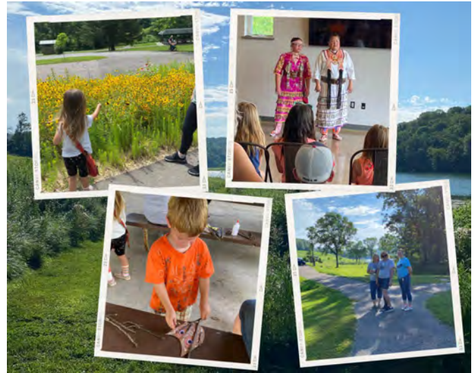
Participants enjoyed learning about Jingle Dancing and exploring White Mound County Park