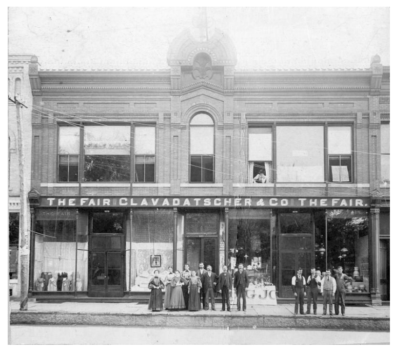
Clavadatscher Block, e.g. 'The Fair' Store, looking south, circa 1886.