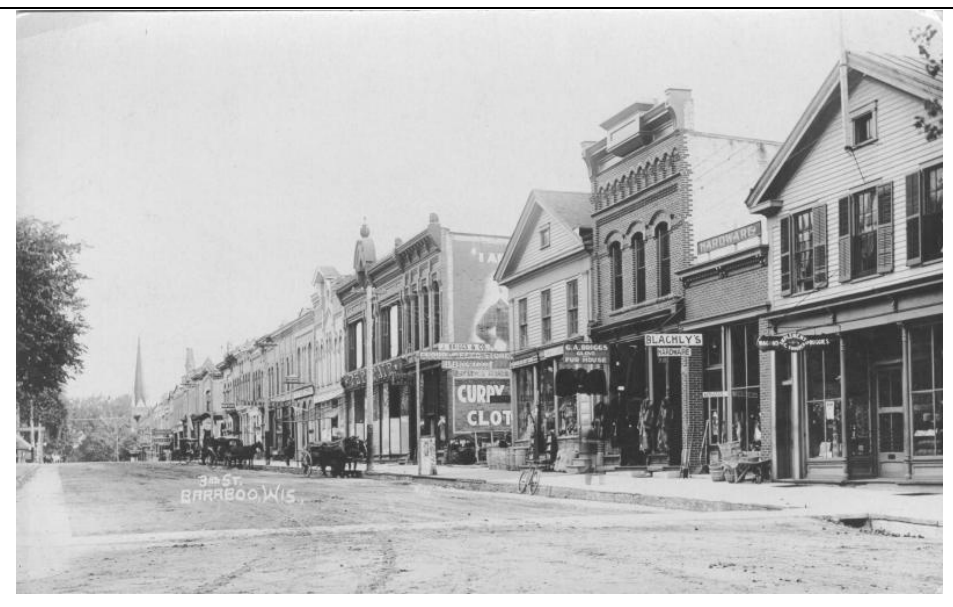
3<sup>rd</sup> Avenue and 3<sup>rd</sup> Street looking southeast, date unknown.

Downtown Baraboo Historic District Baraboo, Sauk County, WI