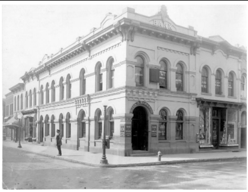
Sauk County Bank looking southwest, circa 1900.

Downtown Baraboo Historic District Baraboo, Sauk County, WI